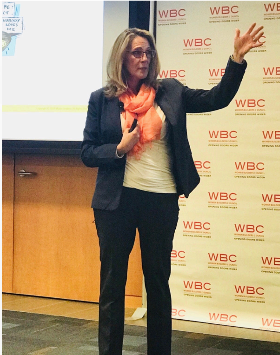
Women's Builders Council