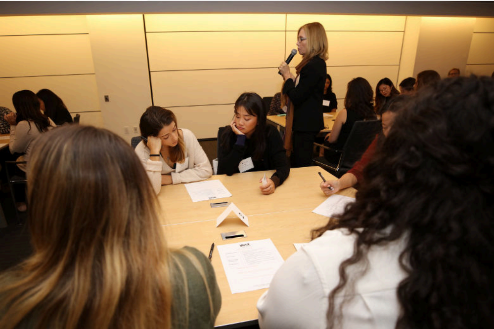
Major League Baseball