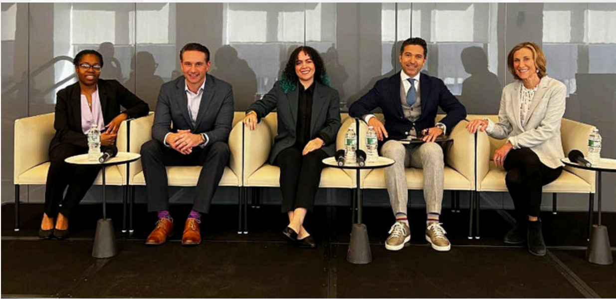
Societe Generale Inclusion Panel March 2024