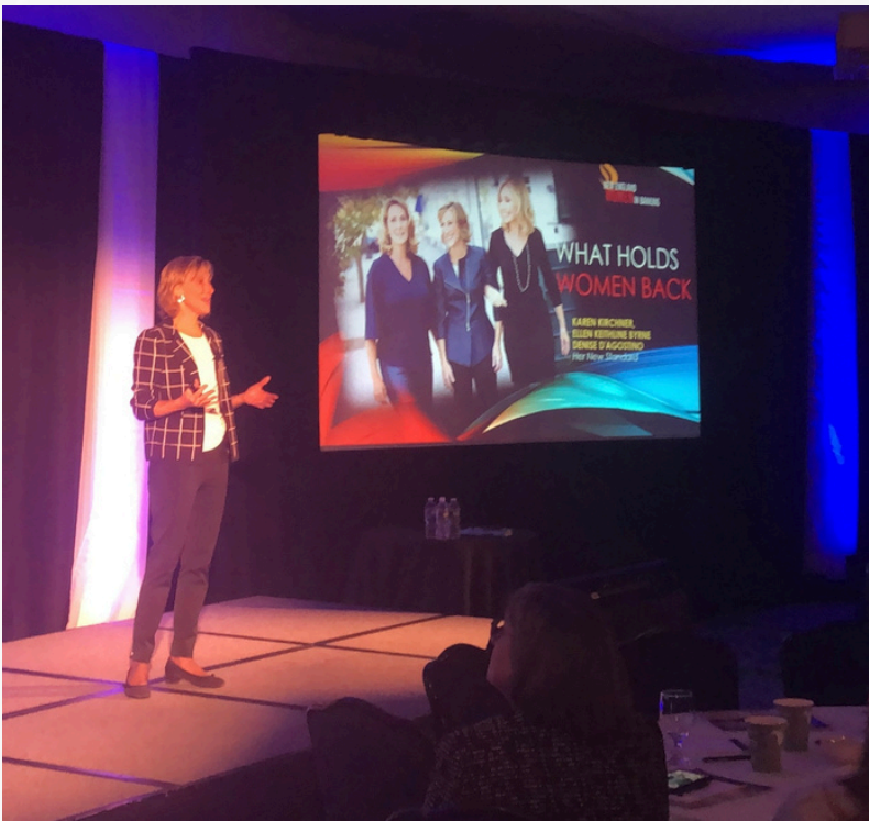
New England Women in Banking Conference